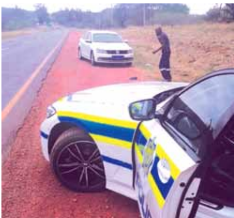
Police Highway Patrol members stopping a suspicious vehicle at Mamone Village where the driver was immediately apprehended after the vehicle was found to be reported stolen in Kimberly.